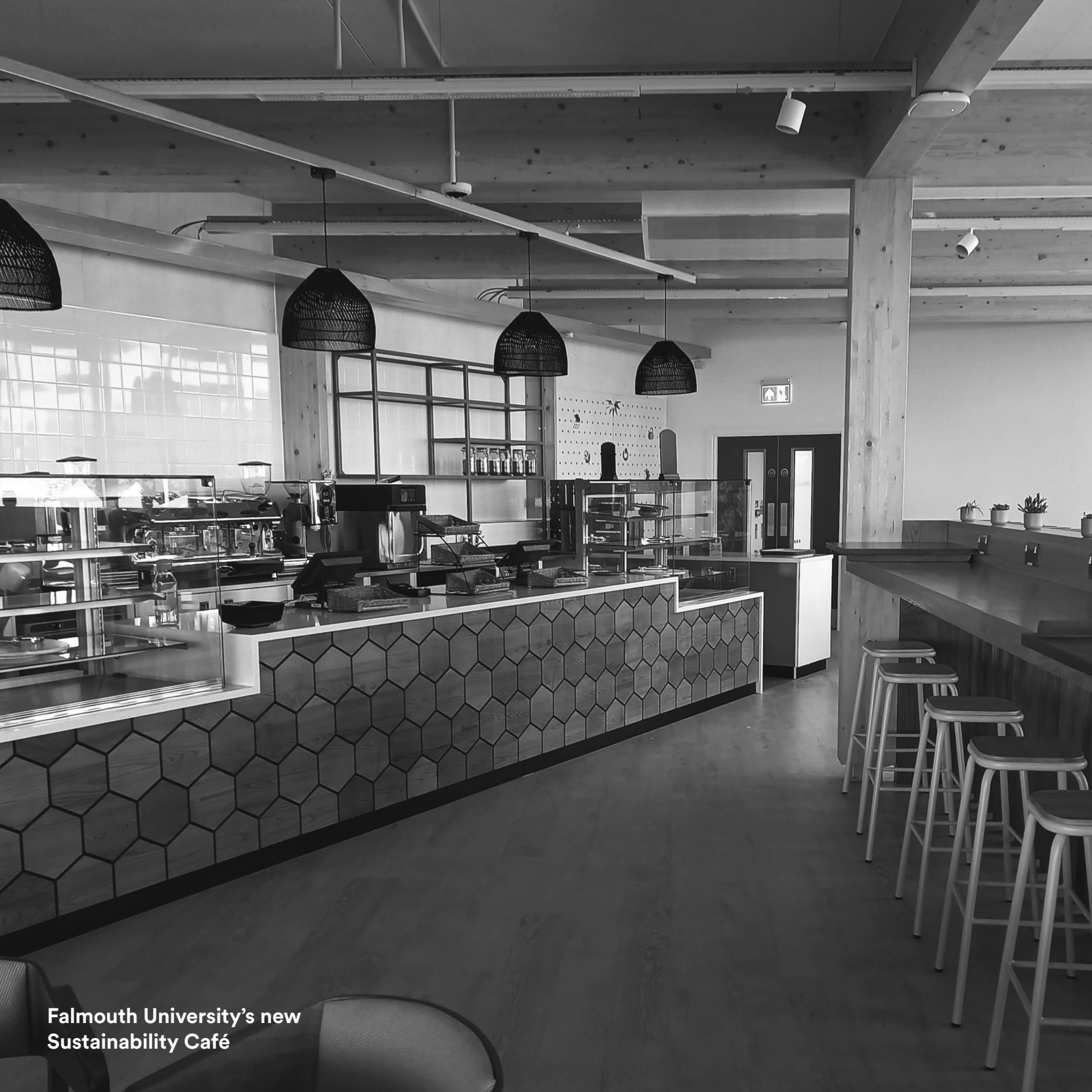
Falmouth University's new Sustainability Café