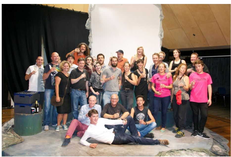
Miracle & Vconect after the show