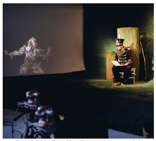
Dogbite's Studio: Prospero to Ariel