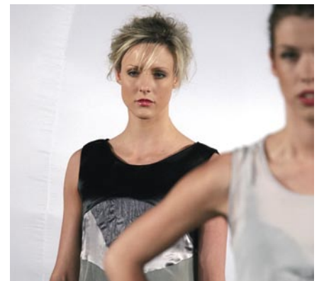
Student models strut their stuff on the catwalk.

Jane Gottelier , joint Course Leader of BA(Hons) Fashion Design and BA(Hons) Performance Sportswear Design, said: "The success of the show is the result of endless and relentless preparation by both students and staff. Fashion is 90% graft and 10% glamour, but the rewards can be amazing."