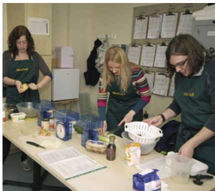
Students perfecting their recipes