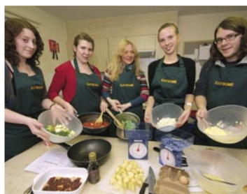
Healthy food, healthy living p4