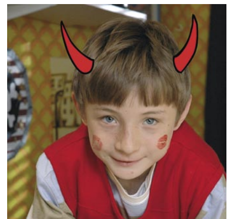
Alistair Fury in animated glory