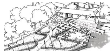
Hugo's award-winning design

Hugo's imaginative design concept was for a self-contained contemporary culinary herb garden that was both educational and practical, for Hugh Fearnley-Whittingstall's River Cottage HQ and cookery school at Park Farm near Axminster. Hugo created an angular and geometric garden which could be seen in the context of the farmhouse and buildings to which it relates and that complemented the agricultural architecture of Park Farm. He also researched edible plants that would survive in an ever-changing climate.