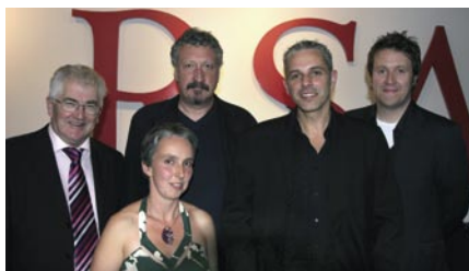
The Illustration team at the Royal Society of Arts, London.