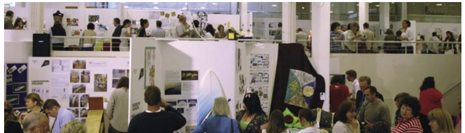
DESIGNED. IN CORNWALL Exhibition

It is hoped that DESIGNED. IN CORNWALL will become a yearly event.