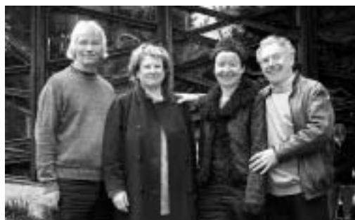
The Universal Hall at Findhorn